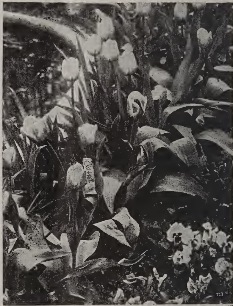
DARWIN TULIPS AND PANSIES

Very dark crimson with purplish bloom on outer petals and white base starred blue. Large flower of distinct color and great beauty. 22-in.